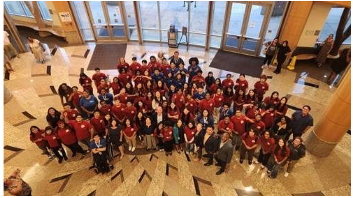
Summer @ City Hall 2024

Here is a video showcasing all the amazing academic and enrichment activities we had this summer.