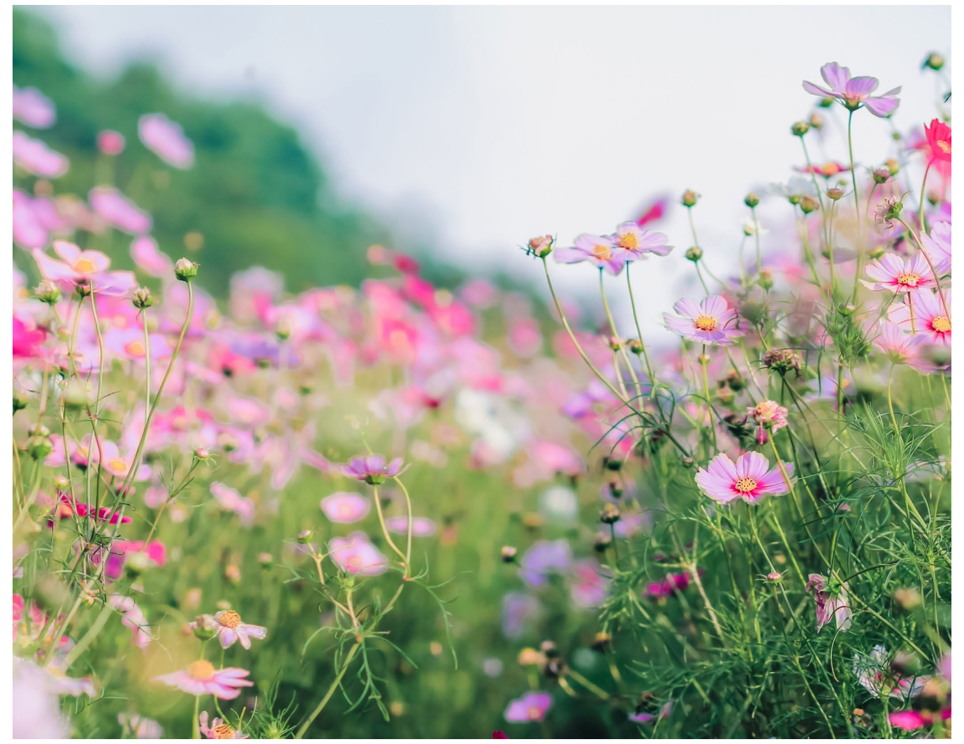
The information described on this page is only intended to be a summary of benefits. It does not describe or include all benefit provisions, limitations, exclusions, or qualifications for coverage. Please review plan documents for full details. If there are any conflicts with information provided on this page, the plan documents will prevail.