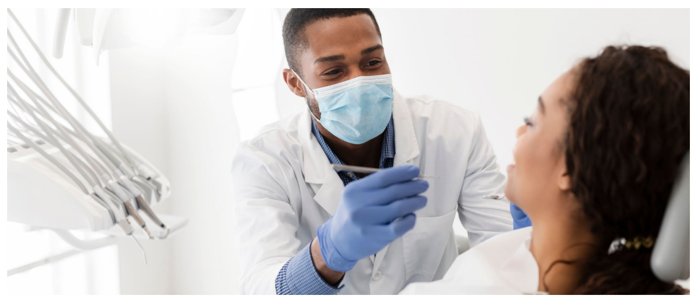
The information described on this page is only intended to be a summary of benefits. It does not describe or include all benefit provisions, limitations, exclusions, or qualifications for coverage. Please review plan documents for full details. If there are any conflicts with information provided on this page, the plan documents will prevail.