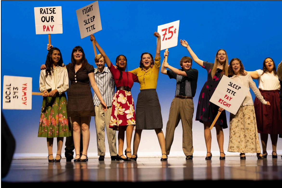
C.K. McClatchy students in The Pajama Game

Every SCUSD student in TK-12 will be provided a high-quality, standards-based, comprehensive, sequential arts education during the school day taught by qualified, credentialed, and trained teachers at any school that they attend.