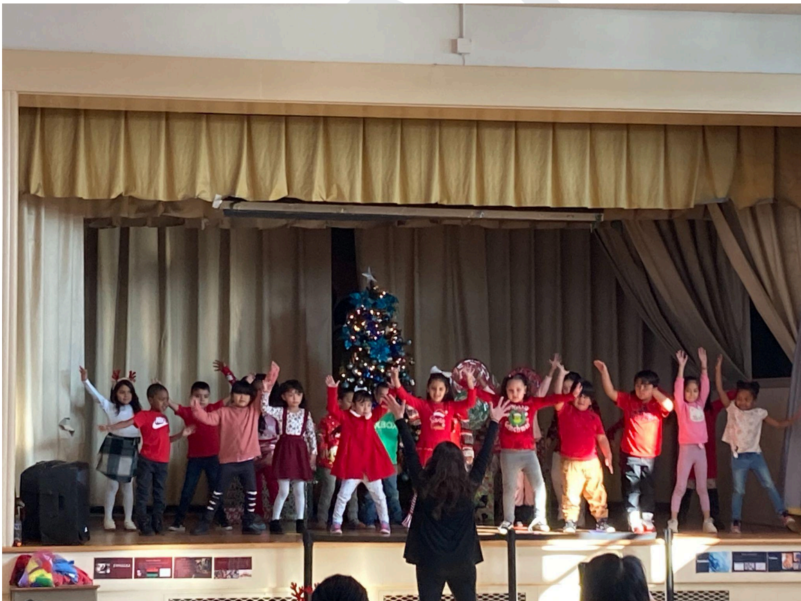
Kindergarten Dance Students perform at Oak Ridge Elementary through a CLARA Residency