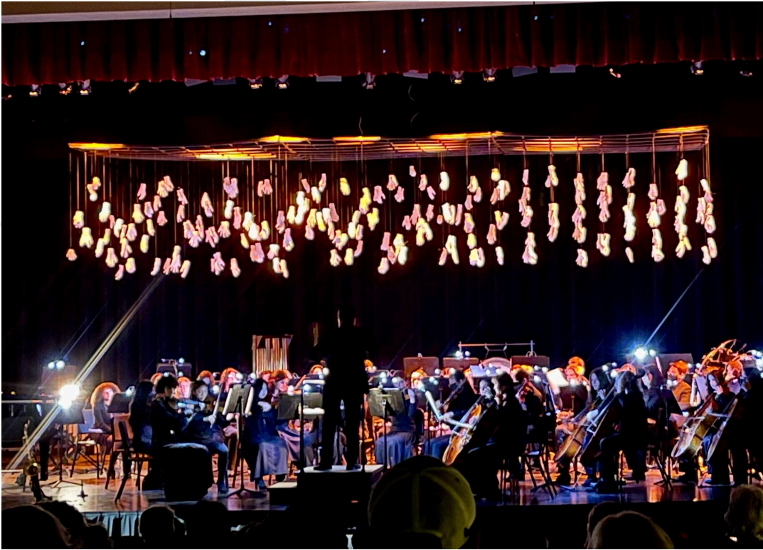
CK McClatchy orchestra students perform during their Arts Immersion Event